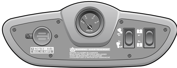
FIGURE 4-4 12-24 VOLT BOW TROLLING PANEL