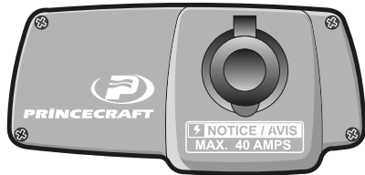
FIGURE 4-2 12- VOLT "ECONO" BOW TROLLING PANEL